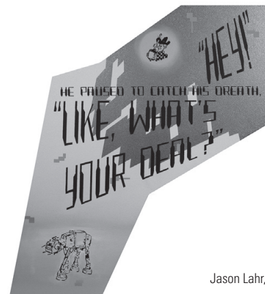
Jason Lahr, "Hey!", 2015, oil acrylic shaped panel

"Level Up: Art Inspired by Gaming Culture" and "Illimat" board game Release The special event on Aug 17 and the ongoing exhibition celebrates Gen Con with the introduction of the game created for the rock band, The Decemberists. Local artists are creating board games for this show.